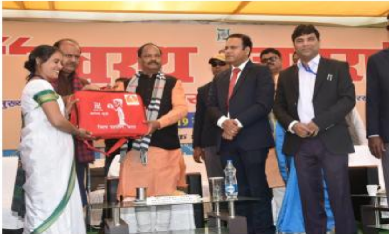
Hon'ble Chief Minister Jharkhand inaugurating Arogya Kunji Initiative

Budetary allocations have been done at the Budget of the State, and in coming days this initiative will be replicated in other districts as “Mukhyamantri Arogya Kunji Yojana”